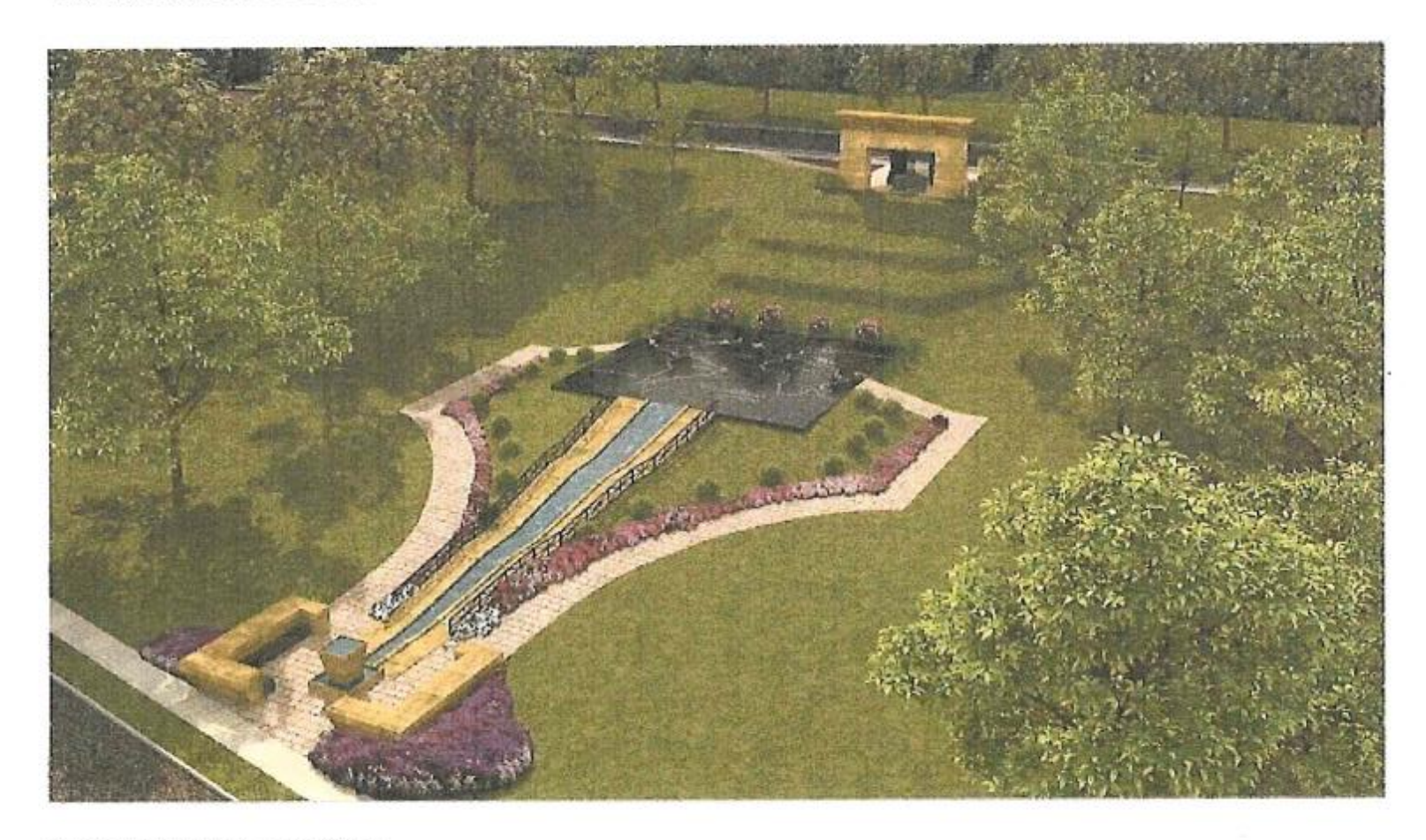
BIRDSEYE VIEW FROM MLK BLVD.