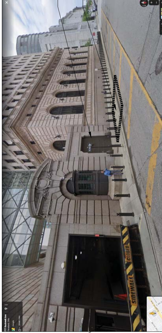
Existing Single Officer Post to be replaced