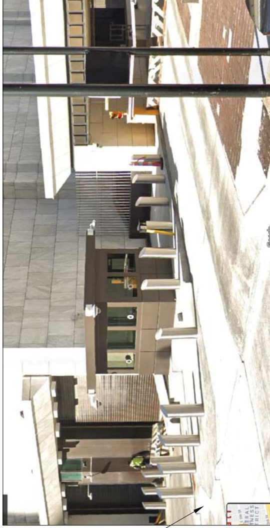
Widened walk and bollard area; new street pavement