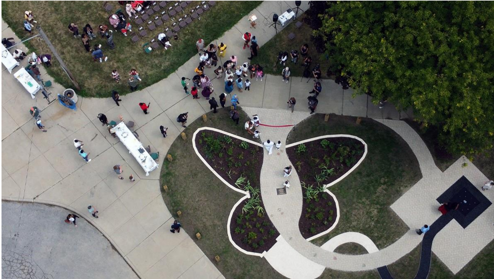
Tamir Rice Memorial