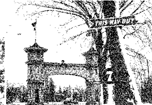
Photo 2560 There was no one out for Euclid Beach in '35; in 4's 1942 picture shows the crowd as he waited for the ice cream. Russell, Alan Hahn Collection