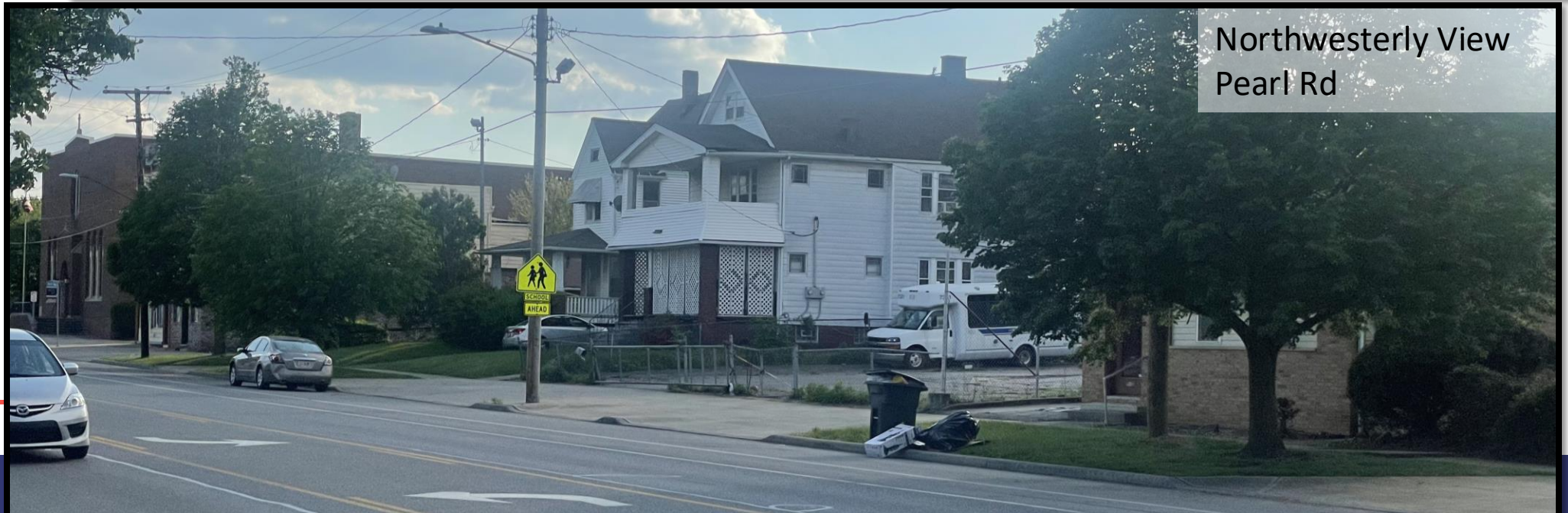
Northwesterly View Pearl Rd