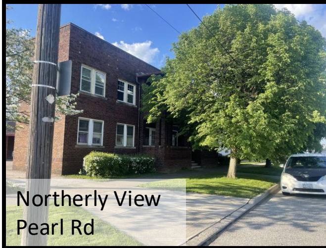
Northerly View Pearl Rd