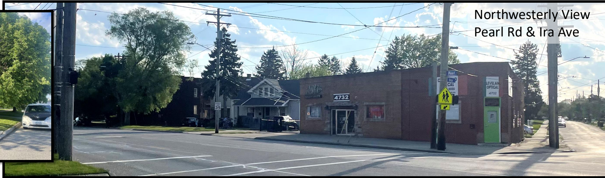
Northwesterly View Pearl Rd & Tra Ave