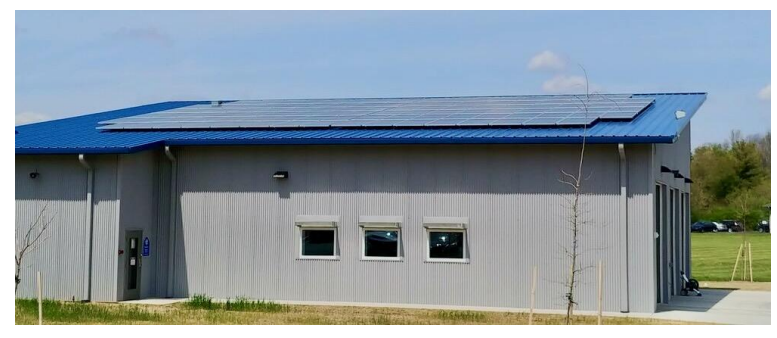
Athens County EMS Station