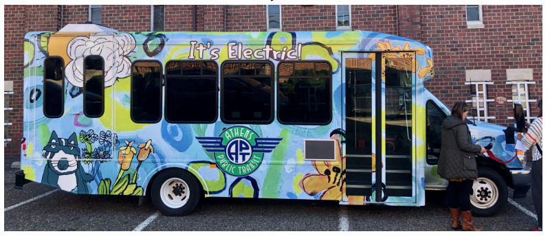
Electric Shuttle Bus in City of Athens