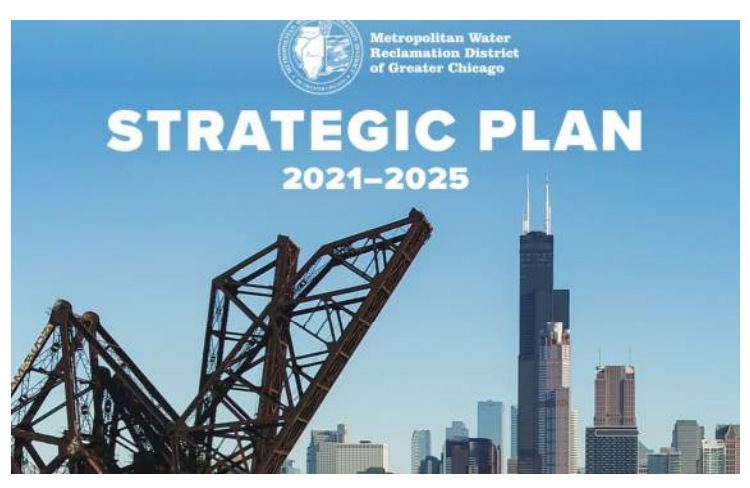
MWRD of Greater Chicago Strategic Plan