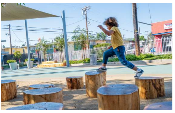
Bradley Green Alley in Los Angeles