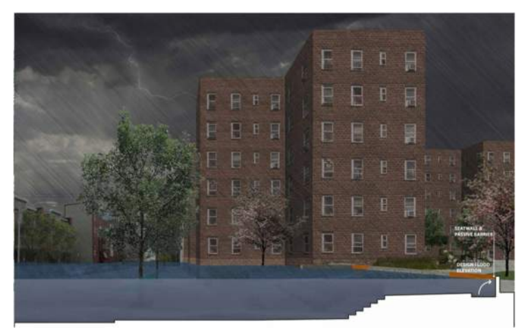
NYCHA Red Hook Houses Sandy Recovery and Resilience