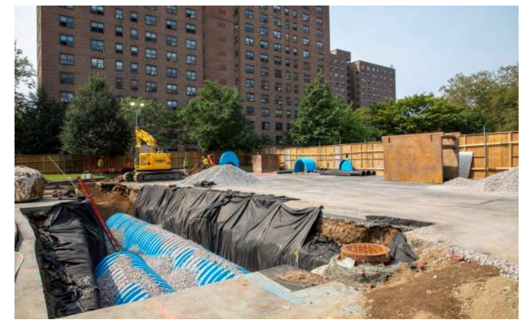
Green Infrastructure for Public Housing