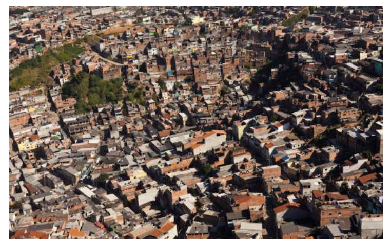
Sao Paolo Sustainable Housing Guidelines