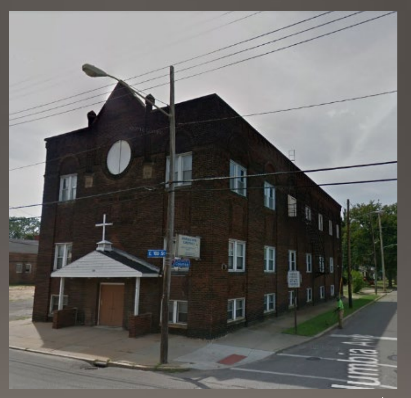
Knesseth Israel Synagogue at 934 E. 105<sup>th</sup> St. (Now Apostolic Faith Tabernacle)