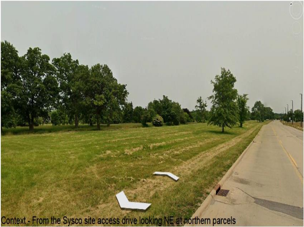
Context - From the Sysco site access drive looking NE at northern parcels