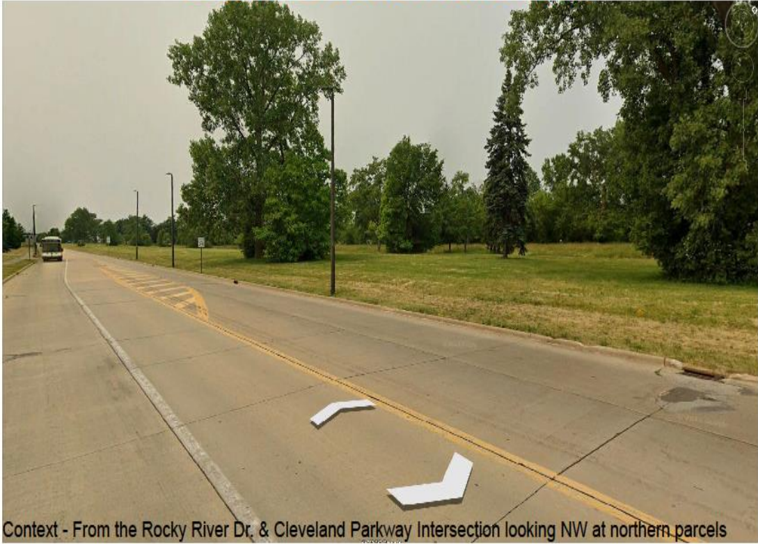
Context - From the Rocky River Dr. & Cleveland Parkway Intersection looking NW at northern parcels