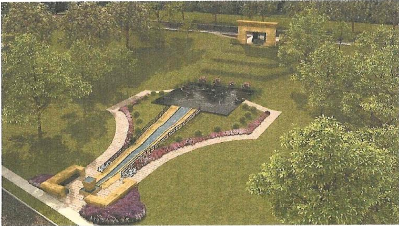
BIRDSEYE VIEW FROM MLK BLVD.