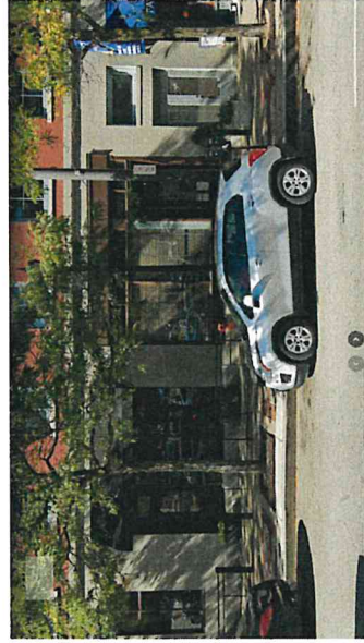
St. Clair Storefront