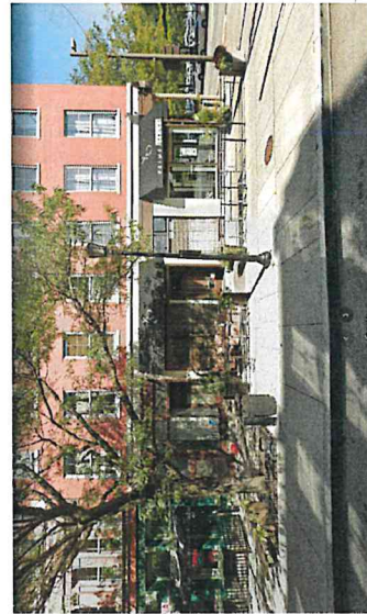
W. 6th Storefront