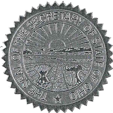
Frank LaRose 51 st Ohio Secretary of State

IN WITNESS HEREOF, I have hereunto set my hand and caused the Seal of the State of Ohio to be affixed. Done at the City of Columbus this 21 st day of September in the year of our Lord two thousand and twenty-one, and of the Independence of the United States of America the two hundred forty-fifth and of the statehood of Ohio the two hundred eighteenth.