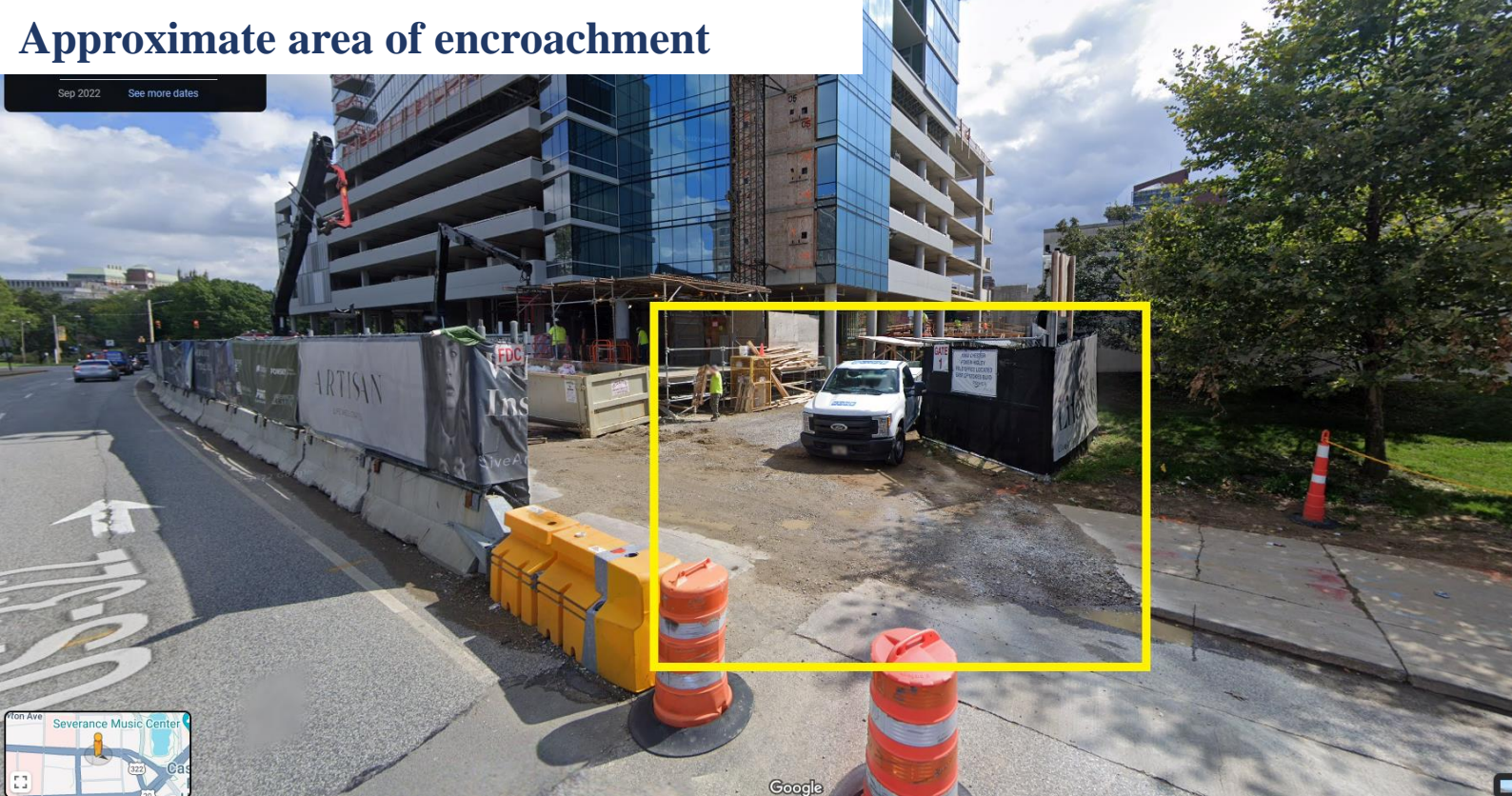
Approximate area of encroachment

Authorizes the Director of Capital Projects to issue a permit to UC City Center LLC to encroach into the public right-of-way of Chester Avenue