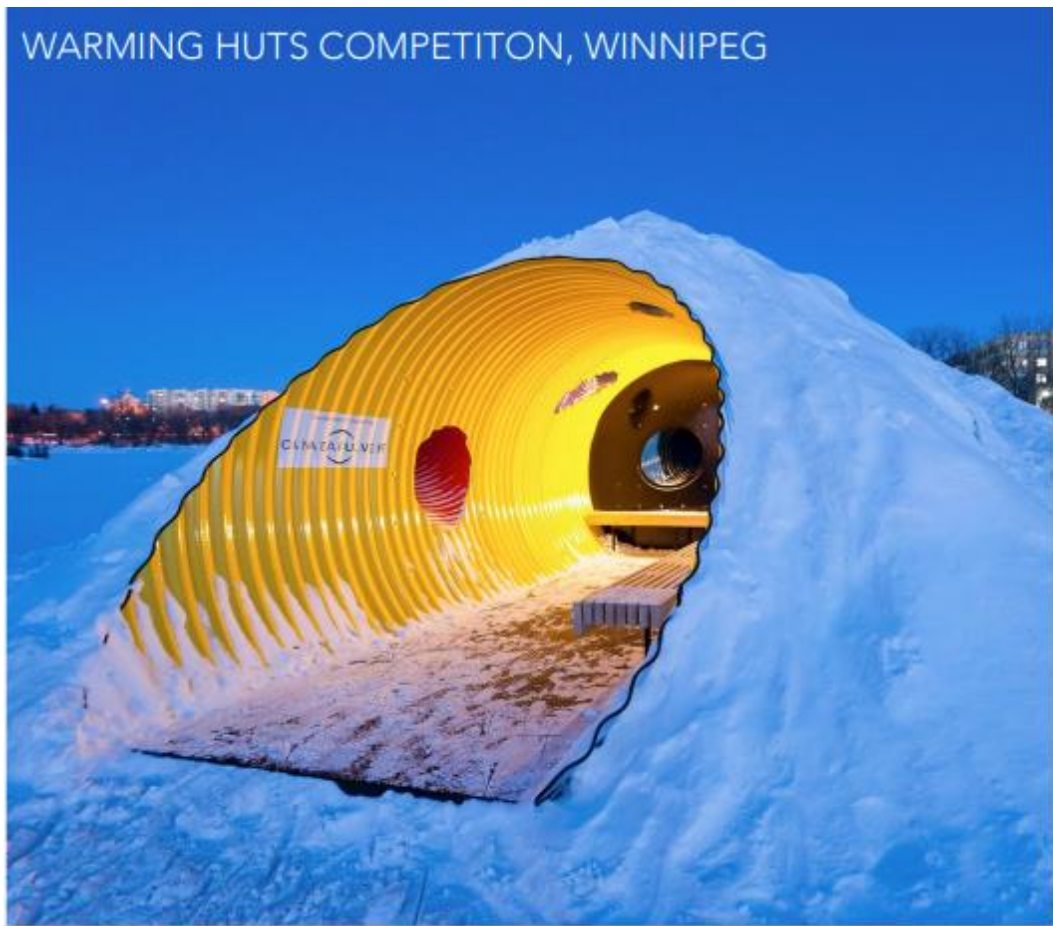
WARMING HUTS COMPETITION, WINNIPEG